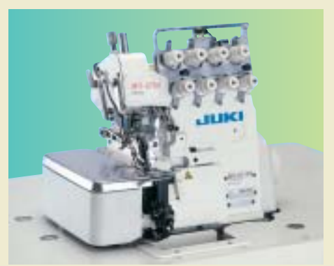
Double-type thread tension control mechanism MO-6714S/LB6