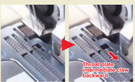
Throat plate intermediate claw forward/backward mechanism (for 2-needle machines)